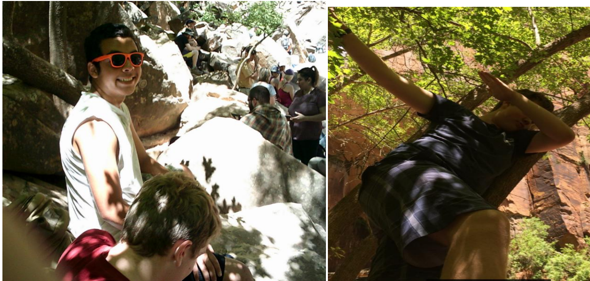
A couple scouts enjoy shade at one of the Emerald Pools

The only thing there is to do here is Hike. But that is OK because it is so scenic. Our first Hike was emerald pools. There was some running water and some shade. The boys like the shade.