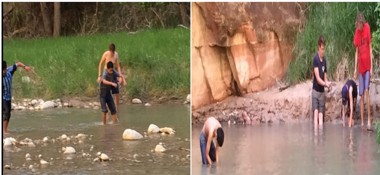
Scouts show how to walk in a rocky cold river, and find some cool stuff in the river bank.

After most of the day hiking the boys wanted to cool off in the river that flows right through the Park. It was extremely cold, but that did not stop the boys from cooling off in a big way.